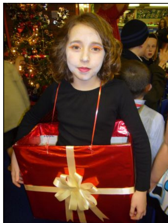
The Ghost of Christmas Present!