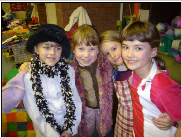
Happy, smiling faces!