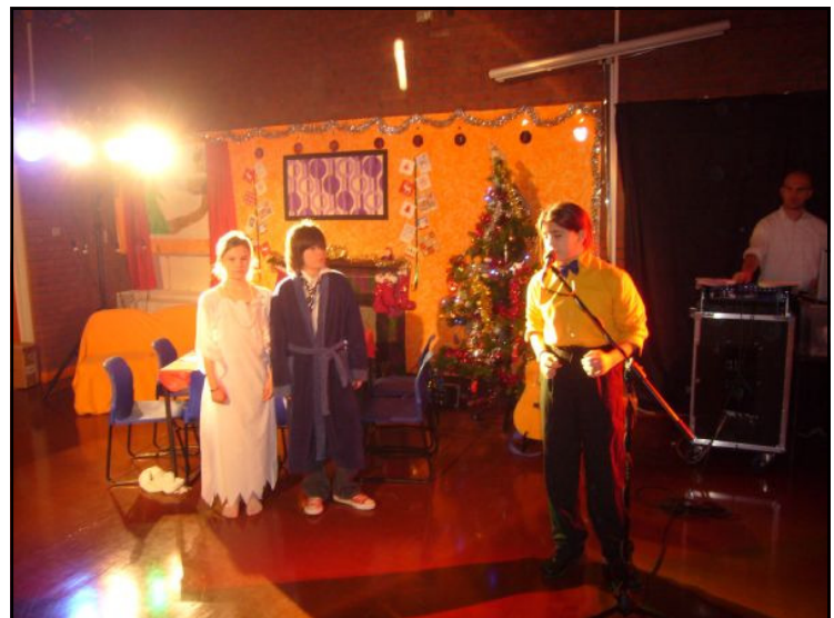
The fool on the hill.....