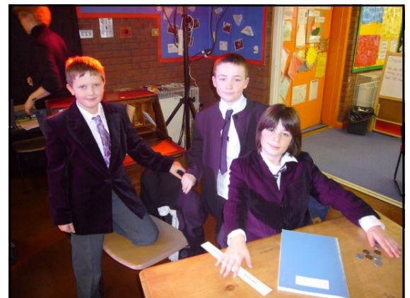
Scrooge, Fred and Bob Cratchitt