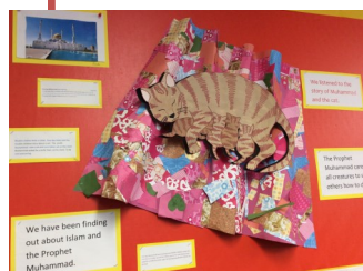
Some of our class displays